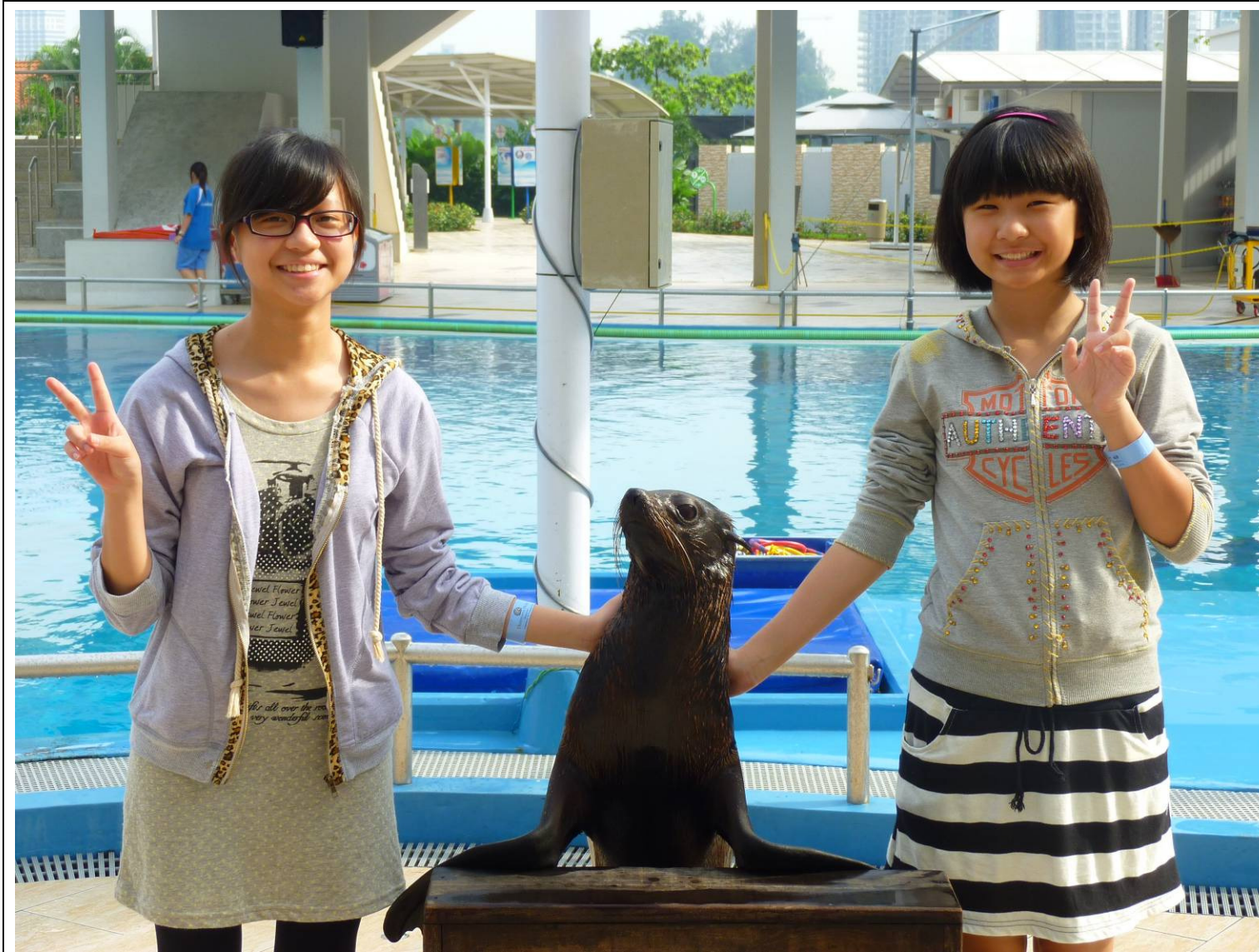
4. Making friends with the seal (Underwater World)