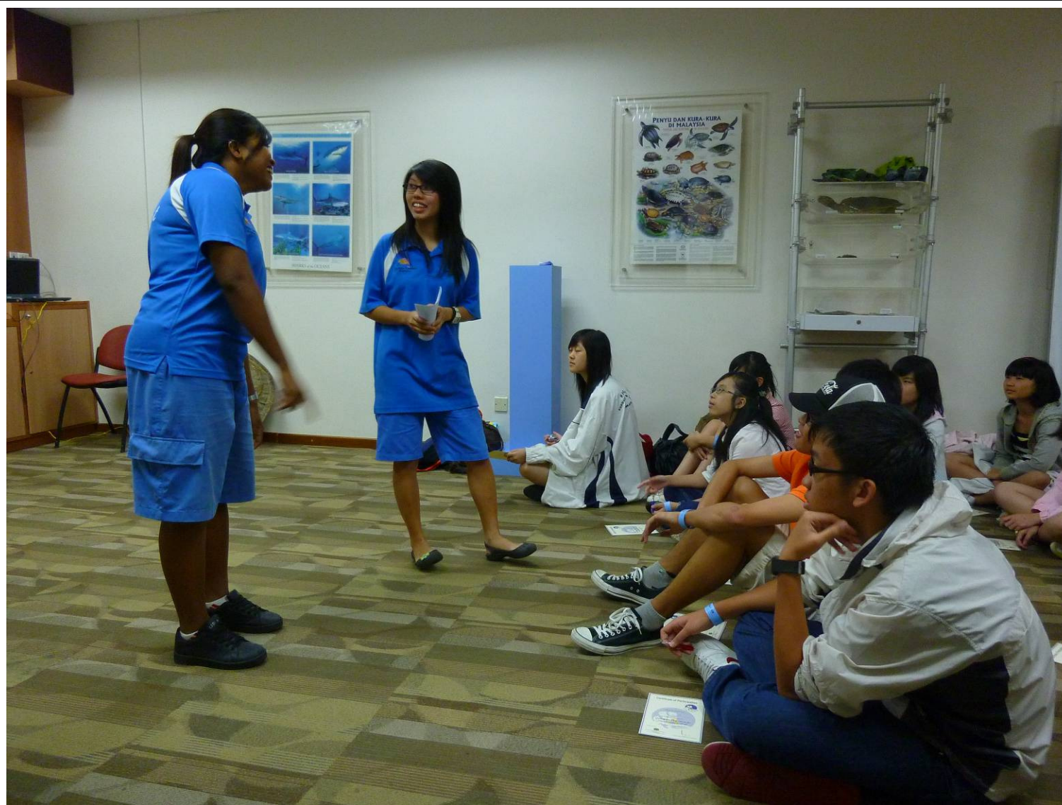
5. Attending an English lecture about protection sea animals (Underwater World)