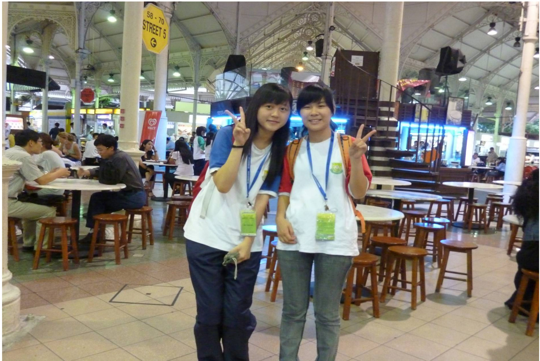
7. Students enjoying their first meal with the locals at Lau Pa Sa -- a Victorian-Style food court