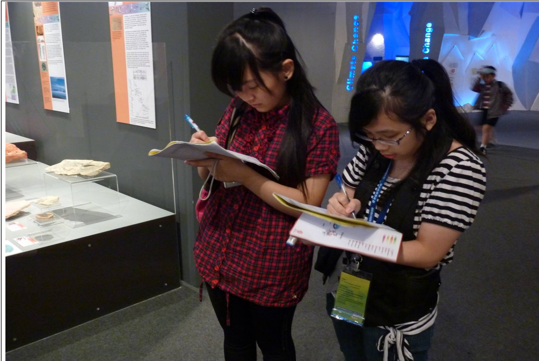
8. Students doing a tailor-made task at the Science Museum after choosing their favourite exhibit