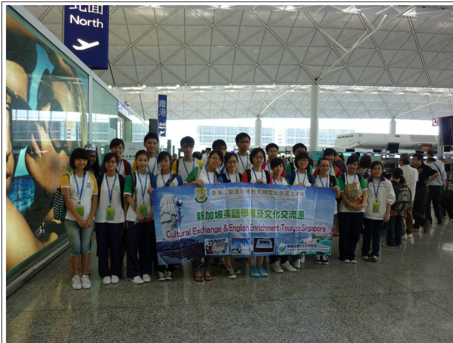
1. Students waiting for departure for Singapore (HK International Airport)