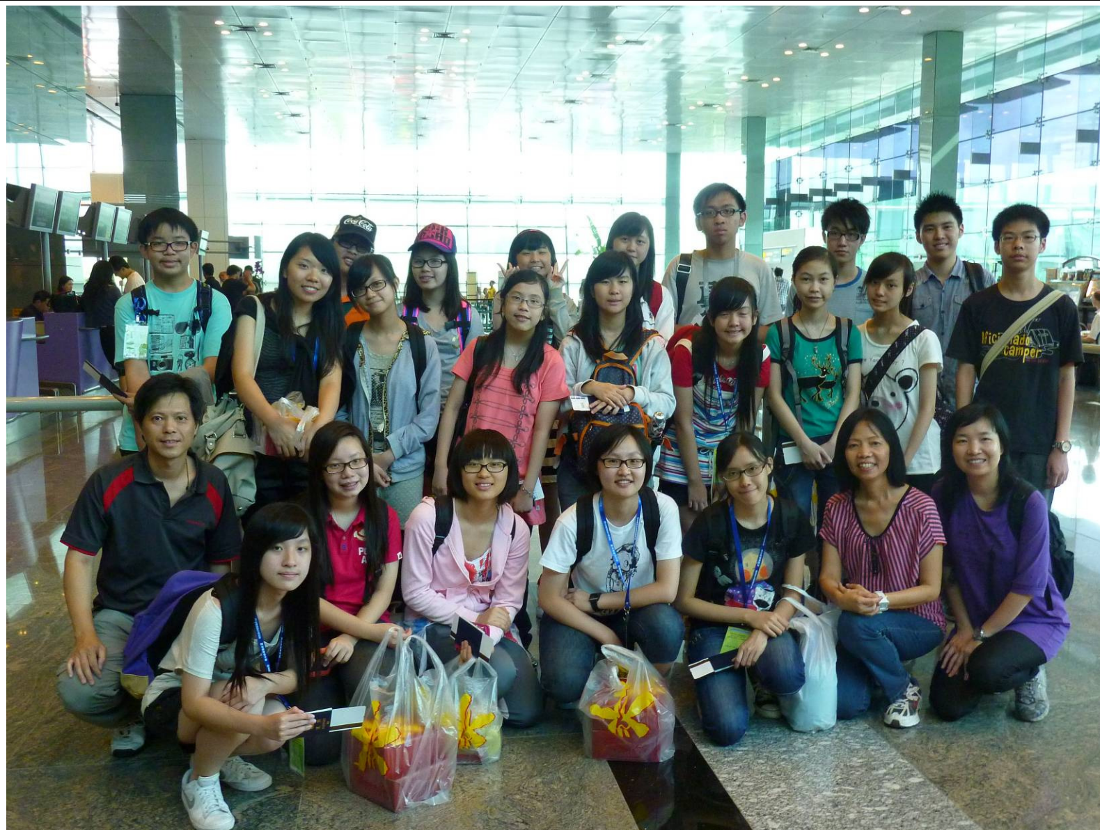
6. Returning to Hong Kong with lots of souvenirs and sweet memories (Singapore Changi Airport)