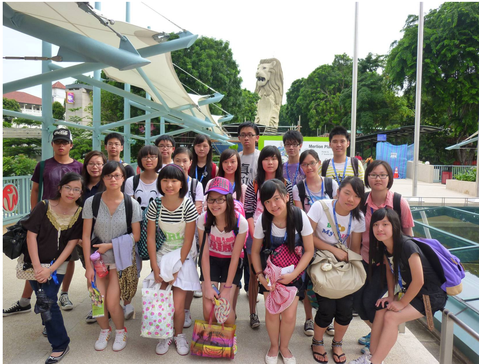
12. A group photo at Sentosa. Can you see the Father Merlion at the back?