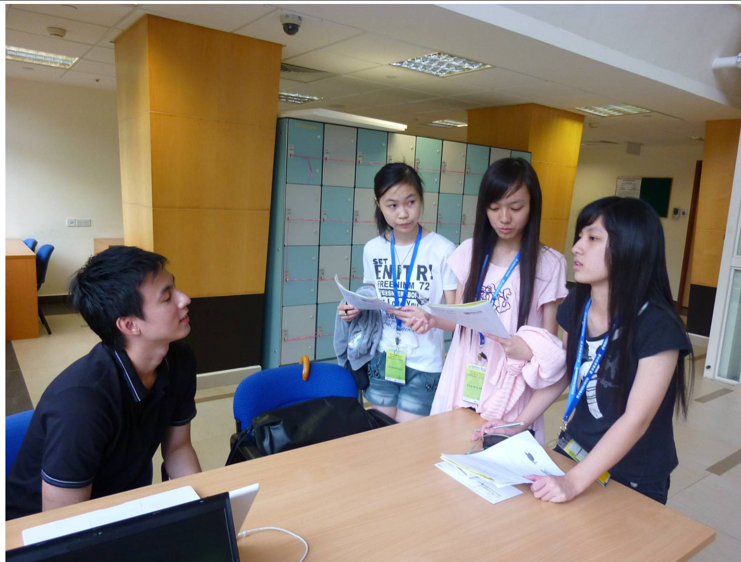
2. Interviewing a local student (National University of Singapore)