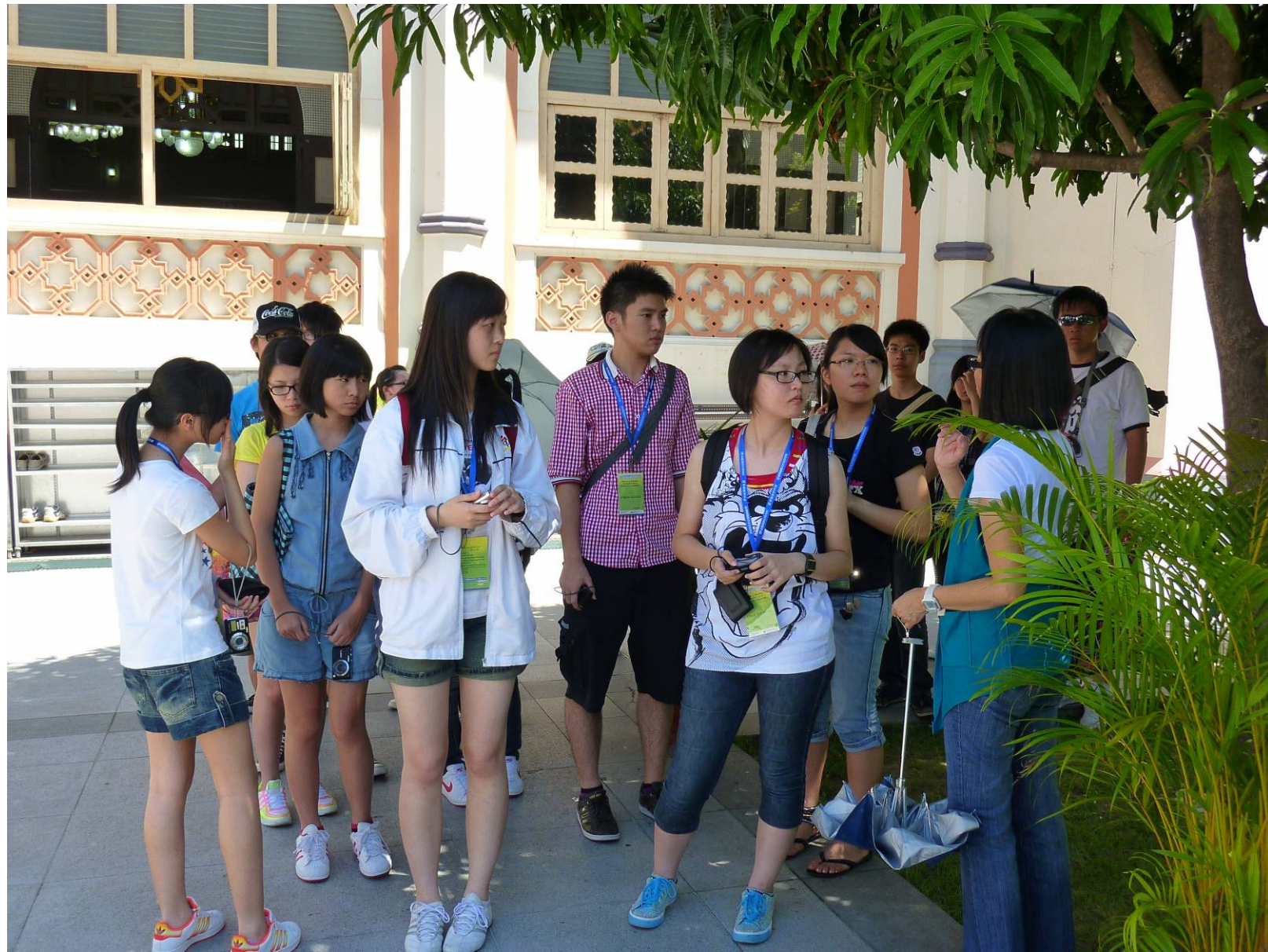
9. The Singaporean local tourist guide introducing the practices and taboo in a Muslim mosque